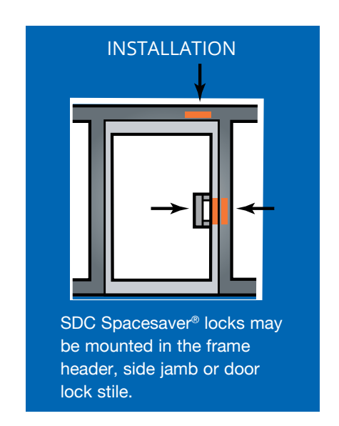
Figure 3A, 3B, 3C, 3D: Typical Frame Header or Side Jamb Installation