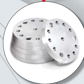
Exploded Door Armature Assembly