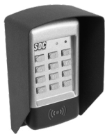
900-PS with 920 Keypad

921P Stand alone, surface mount digital keypad, with Prox Reader and Controller 638.00