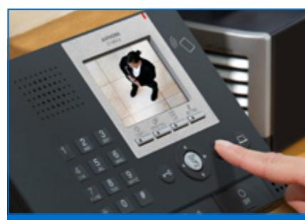
CCTV Camera Integration

Prevent tailgaters from trying to follow patrons into your building. Integrate CCTV cameras to allow your tenants to see a broader view of the entry area.