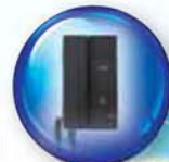
Subs & PA Systems

Assist visitors and communicate between offices using a standard or PC-based master station. Monitor locations during or after hours.