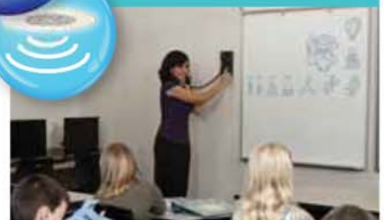
Rooms & Common Areas

Broadcast messages throughout the building or to a particular room or office with the choice of either a hands-free or handset reply.