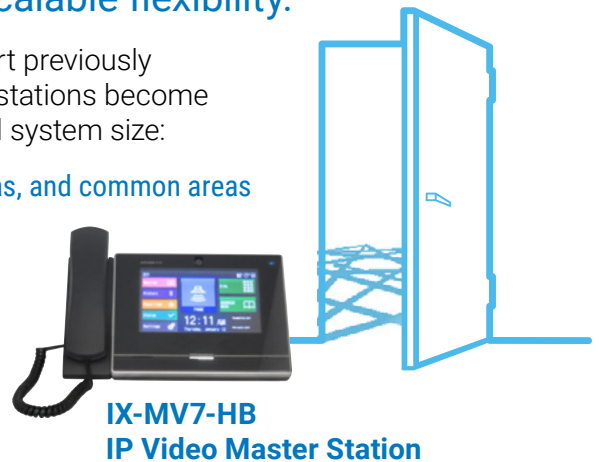
IX-MV7-HB IP Video Master Station

The IX Series delivers increasing value over the lifetime of your investment. It will save you time and money with an overall lower cost of ownership. The IX Series 2 is an investment for the future as stations will be compatible with future generations of the series.