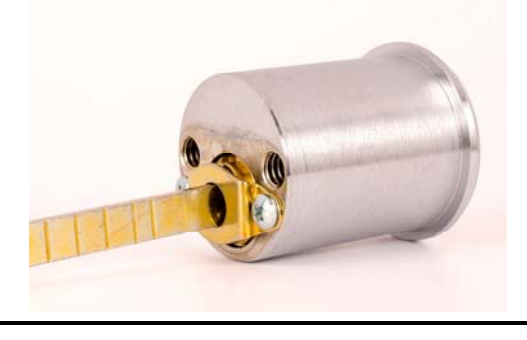
The Standard Tailpiece Must Be Completely Removed From the Cylinder.