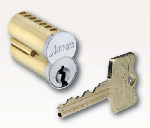
7 PIN INTERCHANGEABLE CORE & PATENTED KEY

The Pointe Flex System offers a totally new concept in interchangeable core key control. The system employs a unique core security feature and patented key design. The unique feature is the pin assembly which runs through the center of the core keyway preventing standard competitive interchangeable core keys from entering the lock cylinder. Only the patented Pointe Flex key can operate locks with the Pointe Flex cylinder. All keyways are restricted and will be issued on a contractual basis, determined by geographical availability. Pointe Flex enables you to create a high/low system, by incorporating core with and without the pin assembly, greatly enhancing flexibility.