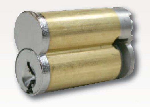
7 PIN POINTE SLIDING DOOR INTERCHANGEABLE CORE

Our precision engineering design, keying capability and availability make Arrow Pointe interchangeable cores our most specified brand for commercial, industrial and institutional applications.