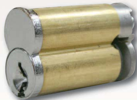
7 PIN POINTE SLIDING DOOR INTERCHANGEABLE CORE

Our precision engineering design, keying capability and availability make Arrow Pointe interchangeable cores our most specified brand for commercial, industrial and institutional applications.