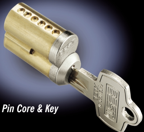
6 Pin Core & Key