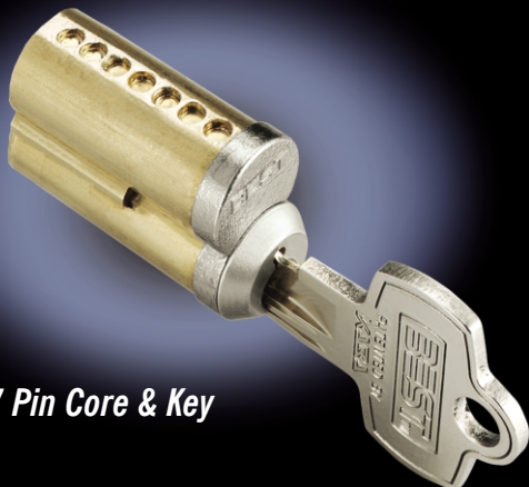
7 Pin Core & Key

For traditional BEST Interchangeable core applications, the 150 series offers the security and convenience of a patented solution that will operate a wide variety of locking hardware, including cylindrical locks, padlocks, deadbolts, and cabinet locks. The 150 series is available in 6 or 7 pin sizes, and utilizes the same service equipment as standard BEST cores. Because the patented pins are factory installed, the Peaks® cores use the same combining procedures as the standard BEST cores.