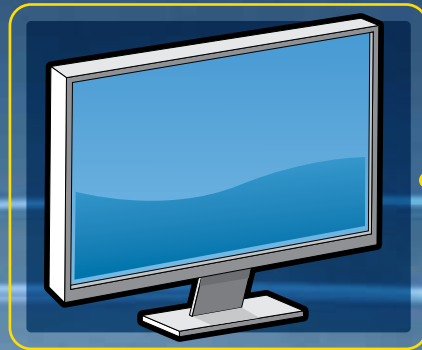
Stanley Wi-Q™ Access Control Software Allows management of access control application

THE SMARTEST SYSTEM IN THE WIRELESS WORLD.