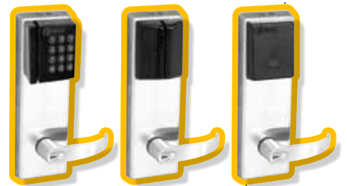
Wireless intelligent readers enable decision making at the door

Choose from multiple reader formats, including dual validation STAND-ALONE LOCKS REQUIRE NO WIRING