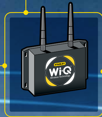
Portal Gateway Enables bidirectional communication between wireless readers and host computer