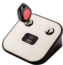
Local Programming Device 768F359