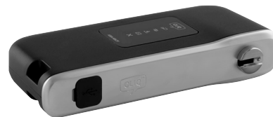
Mobile Programmer 768F379