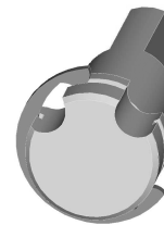
Figure 3: Primus only