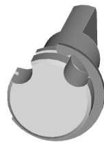
Figure 2: All (except Primus)