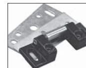
Center Bolt Roller Strike Surface-mounted 3/8" (10mm) diameter roller strike, complete with positive locking plate and shims, assuring low friction relocking for a long, trouble-free life.

Corbin Russwin Architectural Hardware 225 Episcopal Road, Berlin, CT 06037 Phone 800-543-3658 Fax 800-447-6714 www.corbinrusswin.com