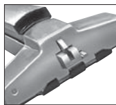
Center Bolt Full 3/4" (19mm) projection, 1" (25mm) wide, positive deadlocking by auxiliary bolt