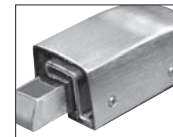
Bottom Bolt 7/8" square stainless steel bolt with 5/8" projection