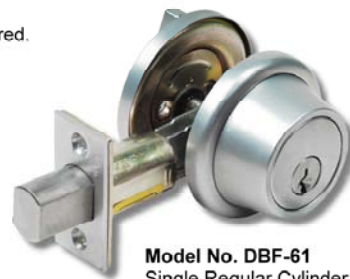
Model No. DBF-61 Single Regular Cylinder