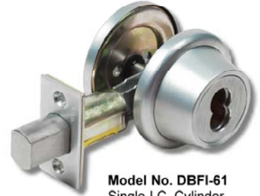
Model No. DBFI-61 Single I.C. Cylinder