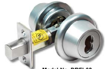
Model No. DBFI-62 Double I.C. Cylinder