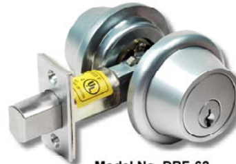
Model No. DBF-62 Double Regular Cylinder