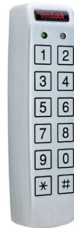
Vandal-Resistant Piezoelectric Keypad

Capacity: 500 users, single/dual code for each Keypad: 2x6 key pad for local programming 4 to 8 digit PIN code entry User Levels: Normal/Secure/Master