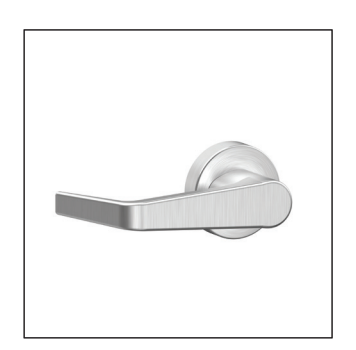
Small rose (SR) Available on levers only Dane lever shown