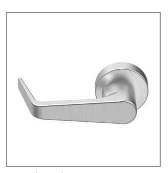
Dane (DAN) Dane with abrasive tactile warning (6DA)<sup>1</sup>