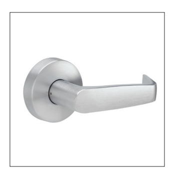
Standard rose Dane lever shown