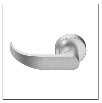
Quantum (QUA) Quantum with abrasive tactile warning (6QU)<sup>1</sup>