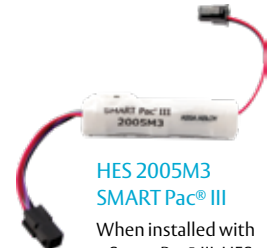
HES 2005M3 SMART Pac® III

When installed with a Smart Pac® III, HES, Folger Adam and Securitron Electric Strikes are upgraded to the SecuriCare no-fault 10-year Warranty.