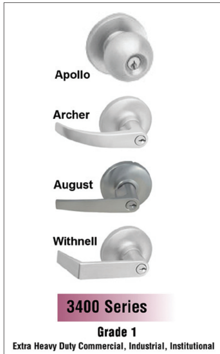
3400 Series cylindrical locks