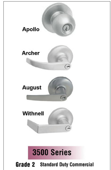
3500 Series cylindrical locks