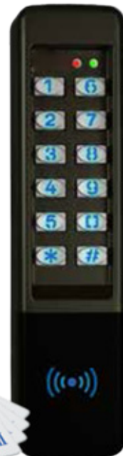
923P WITH PROX READER