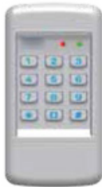
920 EntryCheck® Vandal Resistant, Surface Mount