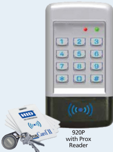
920P with Prox Reader