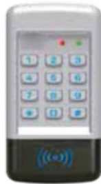
920P EntryCheck® Vandal Resistant, with Prox Reader