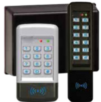
921P & 924P EntryCheck® Vandal Resistant, with Prox Reader, 2 piece Configuration