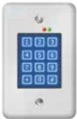
918 EntryCheck® Vandal Resistant, Thick S. S. Faceplate

The IDC EntryCheck™ series consists of stand alone digital keypads designed to control access of a single entry point for facilities with up to 500 users. Each user is assigned a personal identification number (PIN). Keypad entry of a valid one to six digit code activates one or both of the output relays which releases an electric door lock. Optional Prox Readers are available for selective models