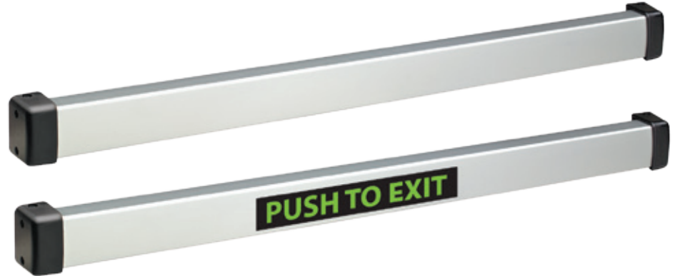
Field installed sign 1" h Green Letters