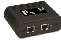
IP Pro Splitter