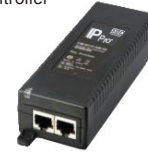
IP Pro Injector