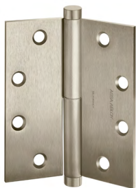
The cleanest of all hinge types. The two knuckle hinge is simple yet sophisticated.

It's all about details, details, details. Even the smallest accessories matter. Dress up your hinge by adding decorative tips to enhance your design. Available for the two, three, or five knuckle hinge, in flat, round, grooved or lined, these tips will give the finishing touches to your decorative suite.