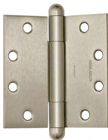
Reliable and classy. The three knuckle hinge provides that little extra detail.