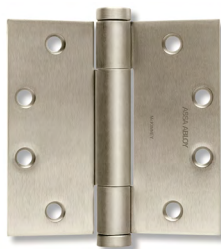
Strength and beauty. The heavy weight three knuckle hinge commands attention.