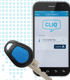
CLIQ CONNECT BLUETOOTH ENABLED KEY