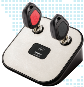
LOCAL PROGRAMMING & AUDIT