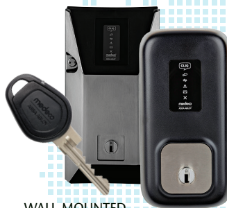
WALL-MOUNTED OUTDOOR PROGRAMMING STATION