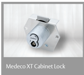
Medeco XT Cabinet Lock