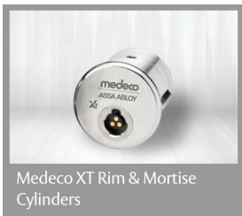
Medeco XT Rim & Mortise Cylinders