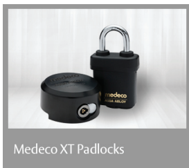
Medeco XT Padlocks