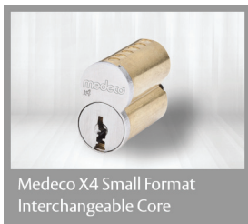
Medeco X4 Small Format Interchangeable Core