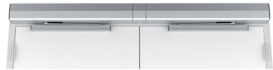
Full-length, modular backplate and cover spans a pair of doors