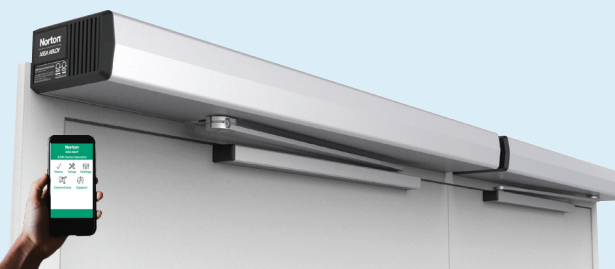
37" length is ideal for double door applications