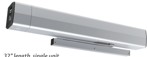
32" length, single unit

Superior door control for rigorous, high-use applications