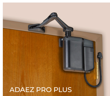
ADAEZ PRO PLUS