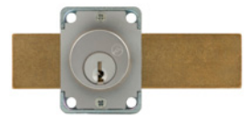
With long-bolt option

Function: Cabinet door lock ANSI/BHMA No. E07121 Barrel length: 15/16" or 1-3/8" Extended bolt: Extends overall bolt length by 1-1/2". Specify -LB option at time of order.