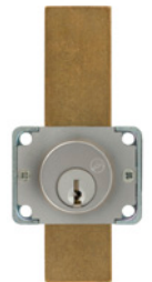
With long-bolt option

Function: Drawer lock ANSI/BHMA No. E07041 Barrel length: 15/16", 1-3/8" or 1-5/8" Extended bolt: Specify -LB option at time of order.