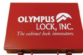
N1 or R1 PIN KIT