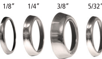
TR201, TR202, TR203, TR204 Trim Collars Available separately