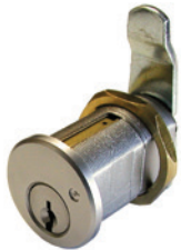
820SC/820LC Schlage C Keyway or Less Cylinder