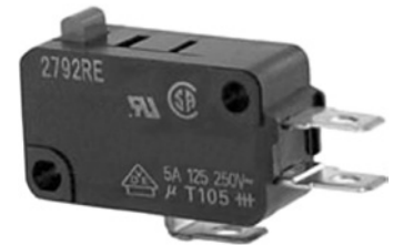
Switch not included.