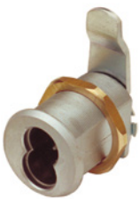
720LM/DM Small Format IC Core