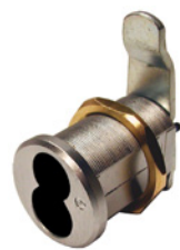
SA54LM/DM Corbin/Russwin IC Core