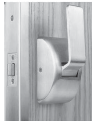
"6000-RC" Round Cover

For door thicknesses less than or greater than the standard 1-3/4", unit will be supplied with custom shafts and mounting screws. Specify door thickness (mortise lock applications have a minimum of 1-3/4" door thickness).