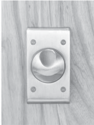
"B" Round Asylum Trim