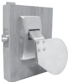
"H" Hip Paddle