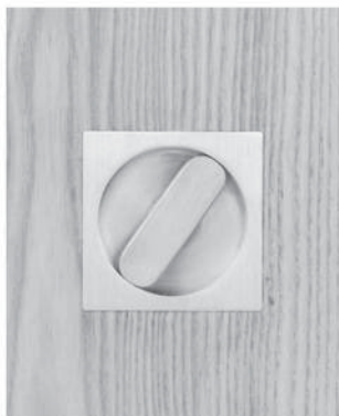
"FM" Flush Mount Asylum Trim

Provides a more sleek and ligature-resistant look in lieu of the standard covers.