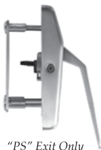
"PS" Exit Only

For applications when only the push side of the door is used to operate the door. Flat trim plate is provided on the pull side and standard push trim is provided on the push side.