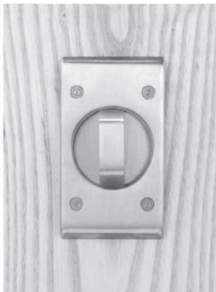
"C" Angled Asylum Trim

Available for some mortise lock bodies - Fail Secure (see C-18 for details).