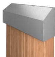
280_-SWTKIT/_ Angled Fascia

*SWTKIT/12 includes enough hardware for two doors.