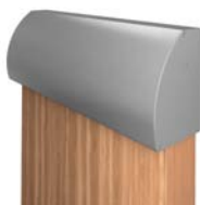
RF280_-SWTK/_ Radius Fascia