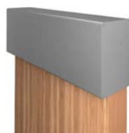
SF280_-SWTK/_ Square Fascia