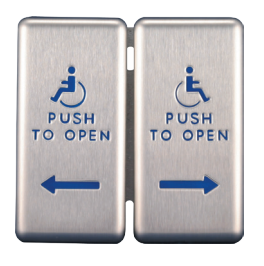
CL2388 Dual Vestibule Push Plate