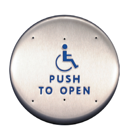
CL2216 Round Plate