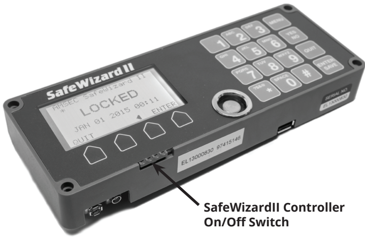
SafeWizardII Controller On/Off Switch