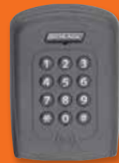
Magnetic stripe (insertion) ▪ KEYPAD