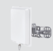
ANT400-REM Remote antenna