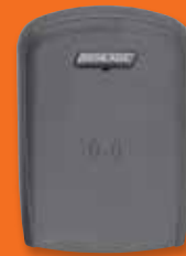
Multi-technology Reads 125 kHz prox and 13.56 MHz smart ▪ KEYPAD ▪ KEYPAD (FIPS 201-1 compliant)

AD Series electronic locks are compatible with many different brands and technologies of credentials.