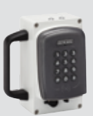
WPR400 wireless portable reader