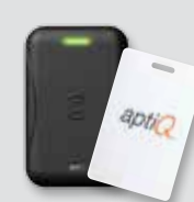
Readers and credentials