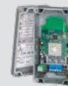
PIM400 Panel interface module