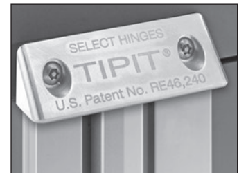
Metal TIPIT® L on Clear anodized SL57 full surface hinge.