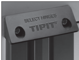
Black polymer TIPIT® L on Dark Bronze SL57 full surface hinge.

NOTE: Not for use with concealed safety hinges (SL71).