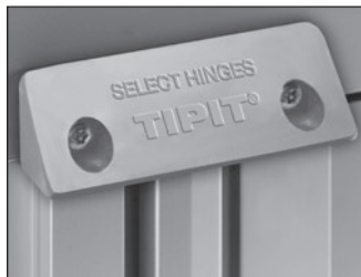
Gray polymer TIPIT® L on Clear anodized SL57 full surface hinge.