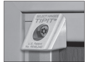
Metal TIPIT® C on Clear anodized concealed hinge.