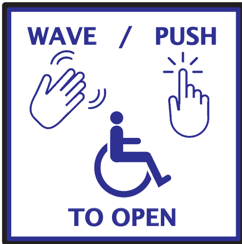
TA120 - WPTO-HC

TA1 Illuminated Wave / Push Buttons are surface mounted with both “WAVE” (touchless) and “PUSH”(touch) activation for standard applications or as part of the Command Access Universal Bathroom Privacy Kit.