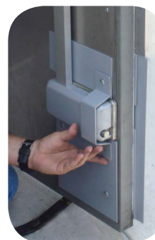
Lower Module Reinforcement Kit