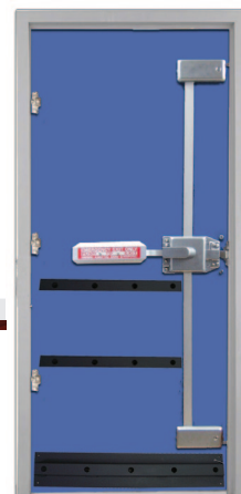
Door Strengthening Bars