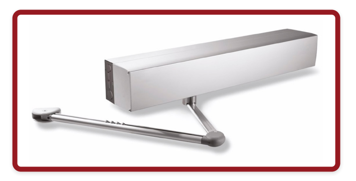
INCLUDED IN KIT 2