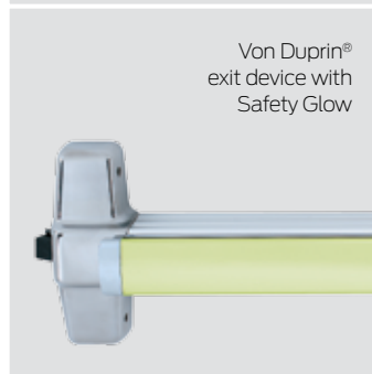
Von Duprin® exit device with Safety Glow