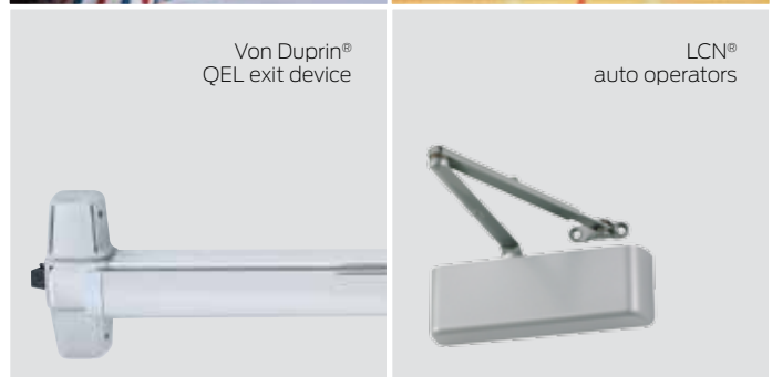
LCN® auto operators