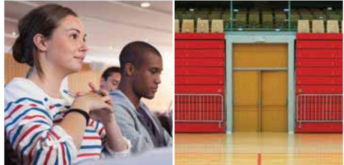
Von Duprin® QEL exit device

Note: These security solutions are designed only as a guide and do not take into consideration local codes and regulations that may be in place. Please contact your local Allegion representative to design a specification to meet your unique needs.