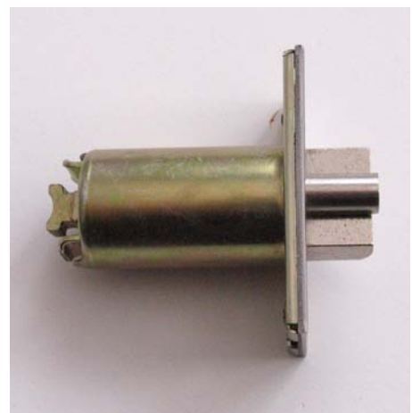
Standard Deadlatch Included: 2 3/4 B.S. P5849 Optional Backset Available: Deadlatch 2 3/8 B.S. S5980-1