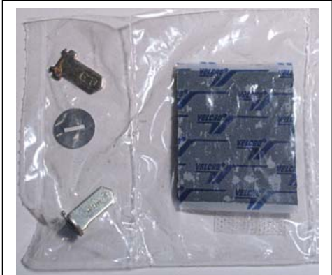
Replacement Tailpieces: • For ILCO/LORI: HW620 • For SCHLAGE: HW580 Tailpiece Washer WA160A Velcro to Secure the Battery