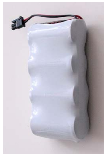
Battery Pack S6181

Outside Housing: 8" H x 3¼" W Inside Housing: 10 5 / 8 " H x 3¼" W Outside & Inside Levers Cylindrical Lock Body Standard Cylinder with 2 Keys