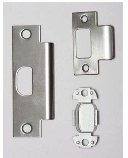
ASA Strike Plate Standard Strike Plate Metal Strike Cup