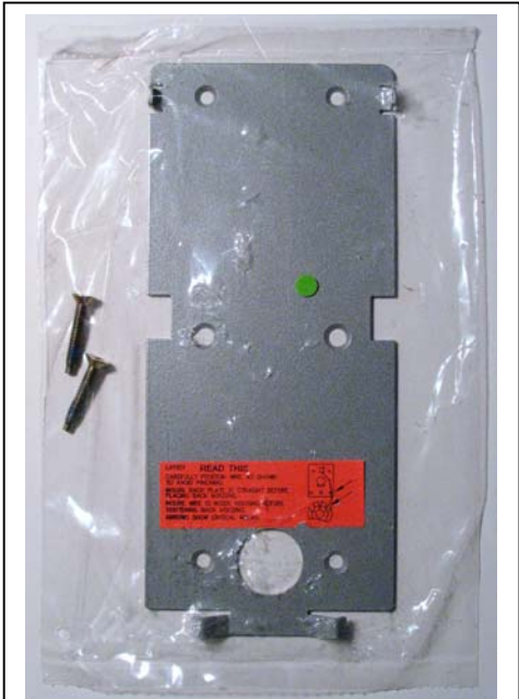
Inside Mounting Plate 2 Screws

345 Bayview Avenue, Amityville, New York, U.S.A. 11701 For Sales and Repairs 1-800-ALA-LOCK • For Technical Service 1-800-645-9440 Fax: 631-789-3383 • info@alarmlock.com Note: Technical Service is for security professionals only