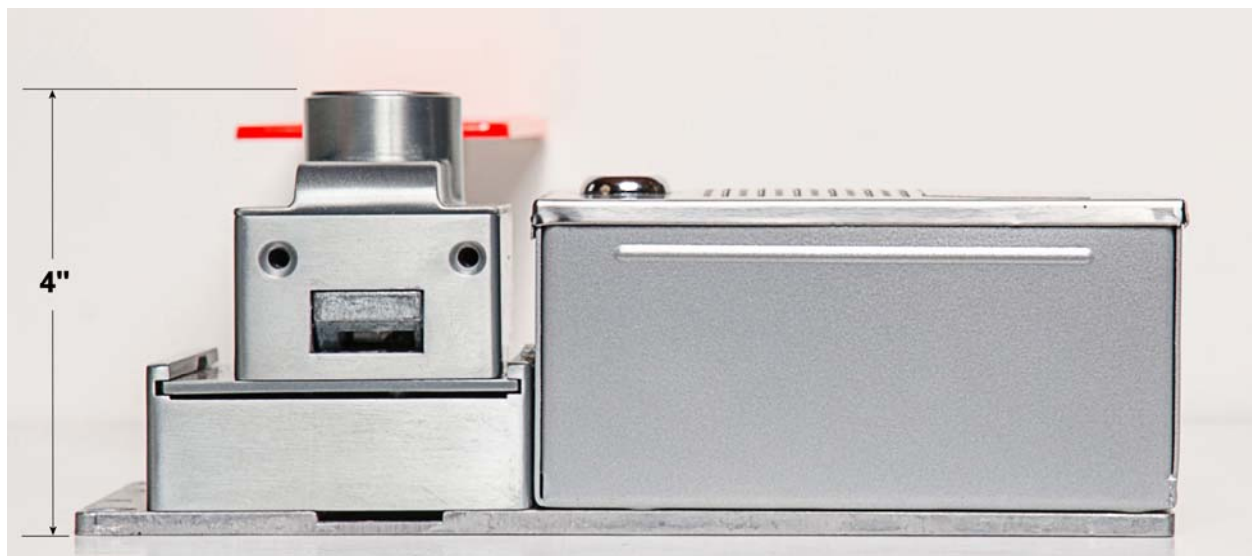
Side View (Deadbolt / Door Edge Side)