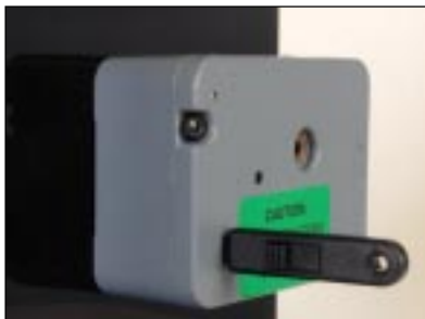
Figure 3 - Insert Change Key

Note: Hold your thumb on the change key retractor while inserting the Change Key to ensure that the pins enter the lock and are not being pushed back into the Change Key.