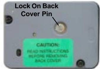
Figure 1 - Lock On Back Cover