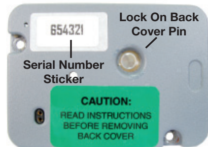
Figure 1 - Lock On Back Cover

Because of the LOBC feature, it is not an easy task to remove the back cover to read the lock serial number after the lock is installed. If you do not have the serial number from the removable label, follow the procedure below to remove the back cover and retrieve the serial number.