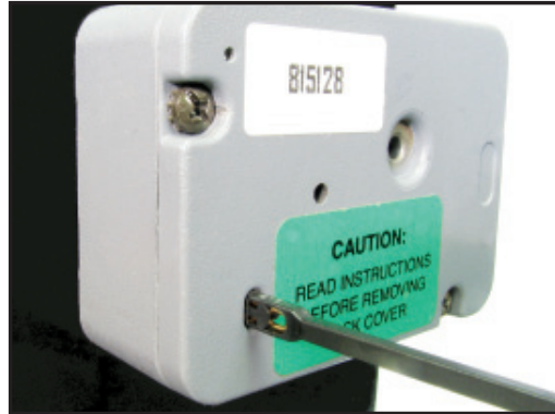
Figure 3 - Insert Change Key

Note: Hold your thumb on the change key retractor while inserting the Change Key to ensure that the pins enter the lock and are not being pushed back into the Change Key.