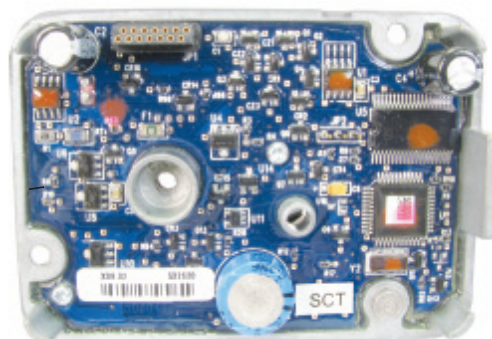
Figure 2 - Serial # on label next to capacitor