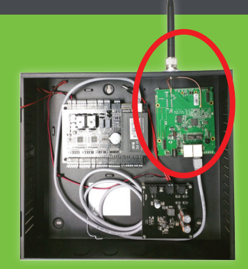
Access Control bundle with Wireless Bridge