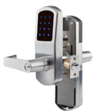
Grade 1 Cylindrical GTS-XLS