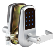
Grade 2 Cylindrical SDS-XLS