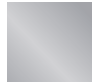
619 (US15) Satin Nickel