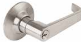
Round Rose - 2-3/4” Diameter