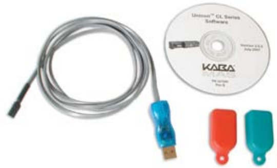
Unicon CL Series Software Implementation Package includes: Install CD-ROM; 1 Reporting (Red) Key Fob (download data from lock); 1 Programming (Teal) Key Fob (upload data to lock); 1 USB Adapter; 1 Key Fob Reader/Data Cable.